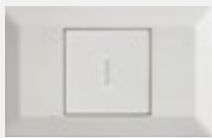
Energy Saving Time delay switches and Sunset switches