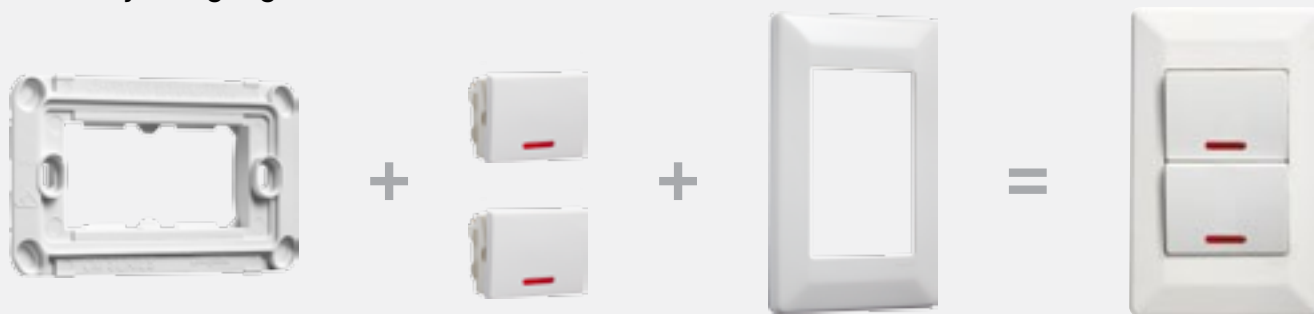
Support Frame CM920SF