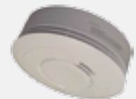
Automation and Alarms Automated functions for senior living. Smoke, flood and other alarms.