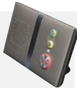
Telecare - Tynetec Personal emergency response systems