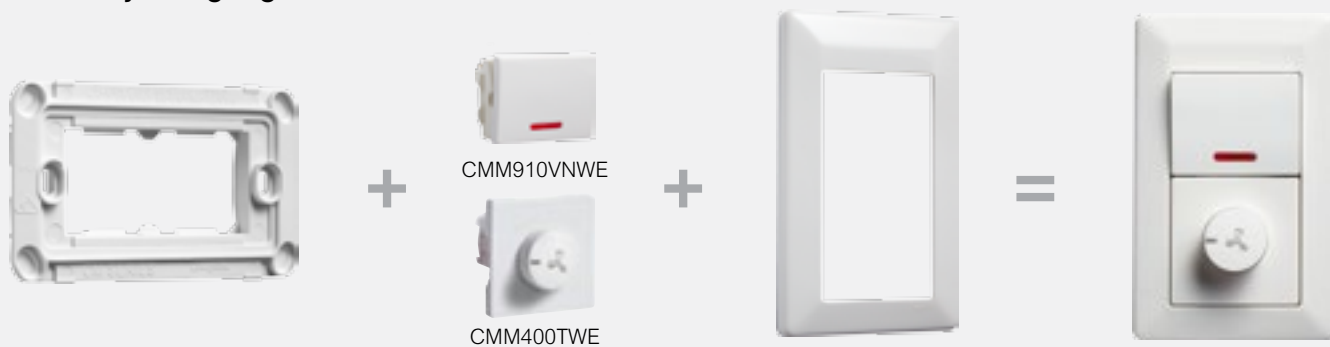
Support Frame CM920SF