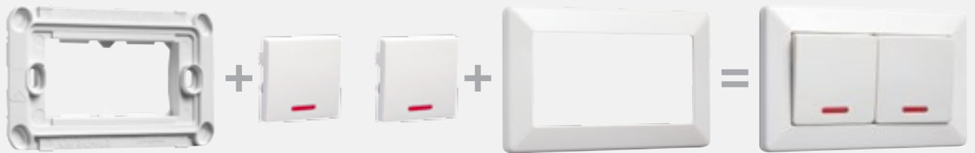
Support Frame CM920SF