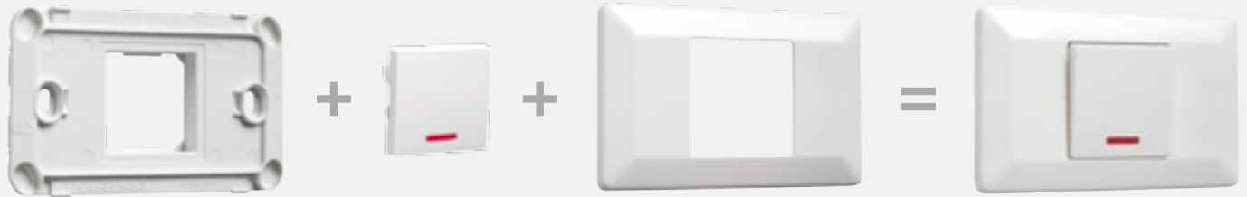
Support Frame CM910SF