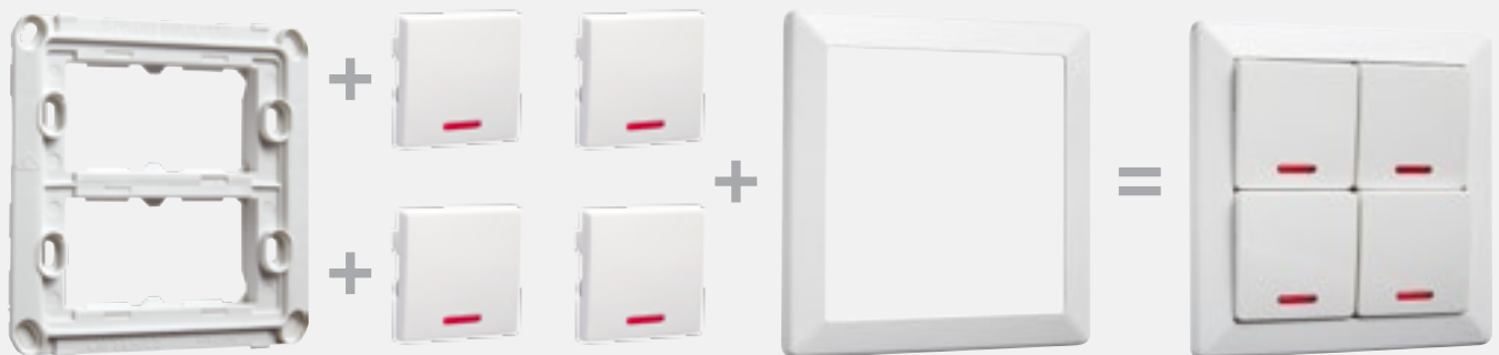
Support Frame CM940SF