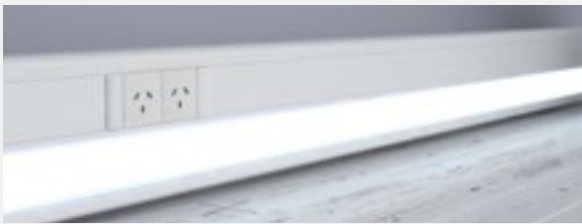
Fall Prevention Skirting lights and Door frame lights

Legrand offers products and systems designed for people who are experiencing a loss of independence, making it easier for them to continue living at home longer.